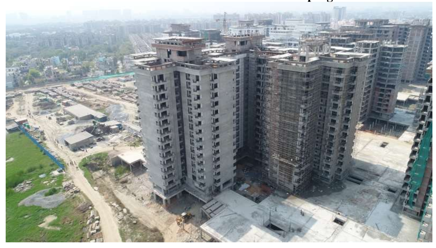
In Block D-07 8th floor Roof slab 100% casted.

In block D-05 External Plaster work is in progress.