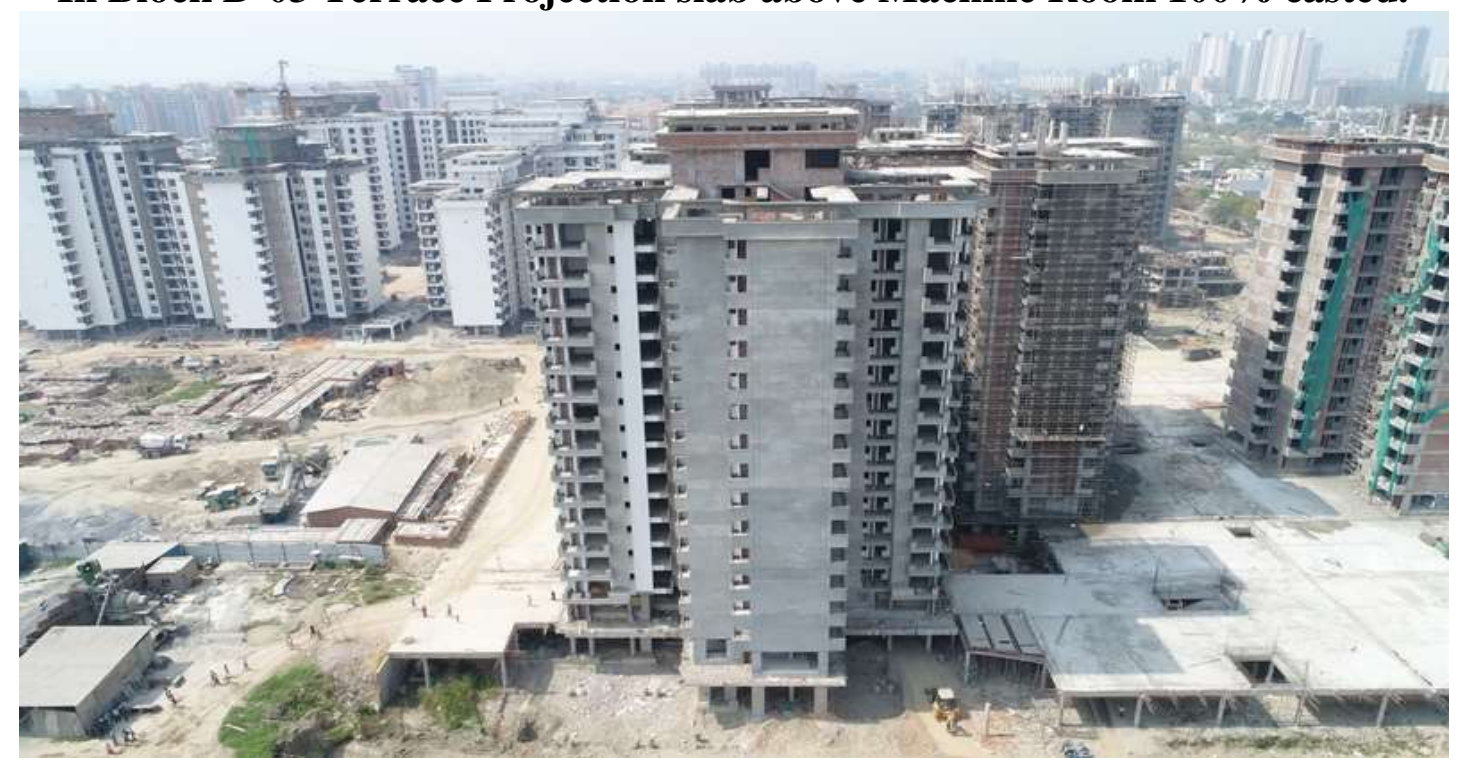
In Block D-04 Machine Room above Stub columns casted.

In Block D-03 Terrace Projection slab above Machine Room 100% casted.